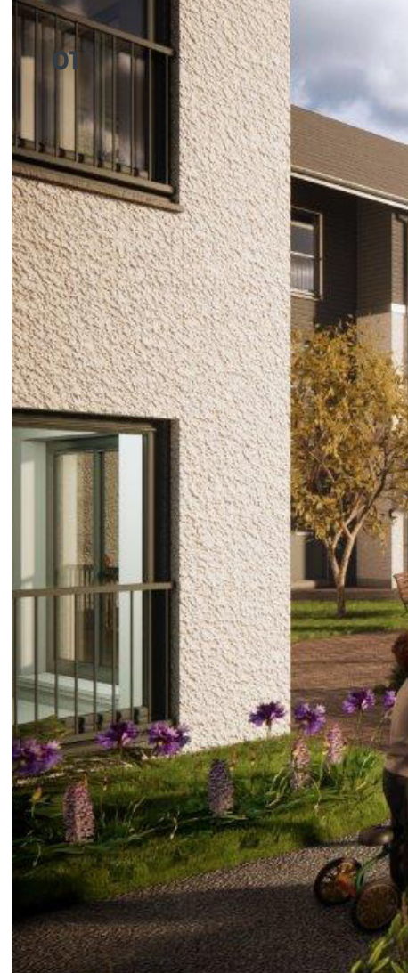
02 Steads Place