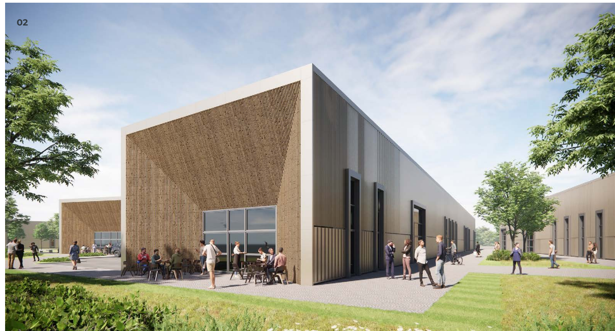
02 Sheriffhall Mixed Use Development