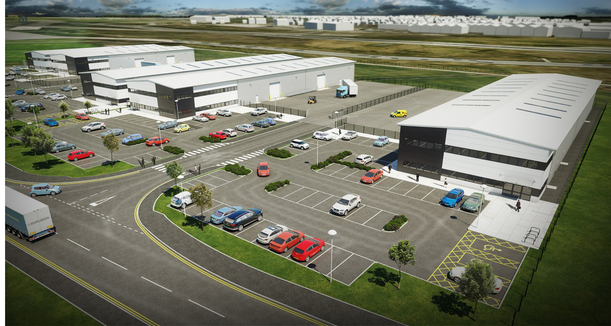
01 ABZ Business Park

In addition to the alternative structure, the units have been designed on a modular basis with interchangeable elements so that they are endlessly adaptable. This highly flexible approach ensures the buildings will have the longest possible lifespan, meeting the changing needs of different businesses over time.